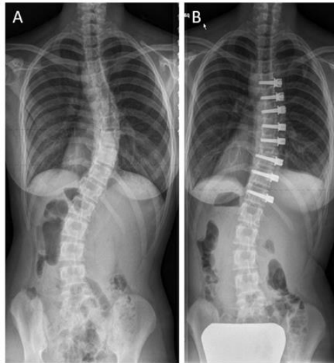
Figure 1: A- Pre-Op radiograph of a 53 degree progressive curve in a recently post-menarchal, Risser 1, 13 year old healthy female. B- 2 weeks post-Op radiograph after thoracoscopic VBT with an initial 50% curve correction.

There has been significant patient and family interest in this “fusionless, minimally invasive” procedure, which is now being done in 4 Canadian cities; Montreal, Vancouver, Halifax and Ottawa. To date, 4 VBTs have been performed at CHEO with great initial success. Our current indications for VBT are: surgical magnitude or progressive curves, ongoing growth potential (pre-menarchal, Risser 0-2), and main thoracic curves. Please tune in to the CHEO Telethon on June 9-10 th , 2018 for a patient story on VBT.