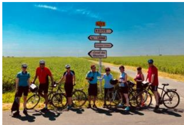
Course participants enjoy biking in the beautiful Loire Valley