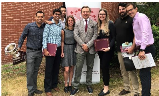
CONGRATULATIONS TO OUR GRADUATING CLASS OF 2020!

Finally, I would like to wish all of you a great end of summer and despite the adversity that we have faced, we must not forget our own personal health which is key to our resilience.