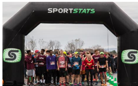
"On your mark, get set, go!!!!"

Fractures. Journal of orthopaedic trauma. 2017 Jan;31(1):1-8